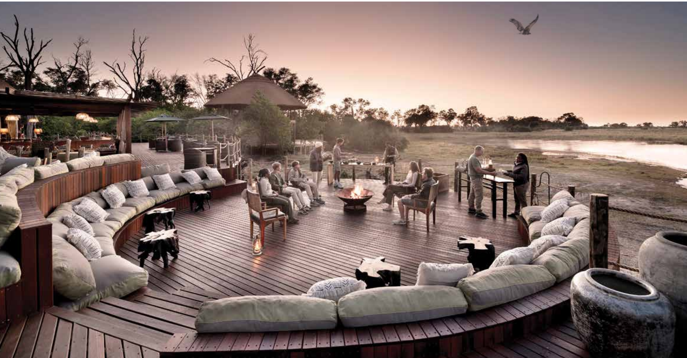
Sustainable luxury at the heart of the Okavango Delta, Botswana