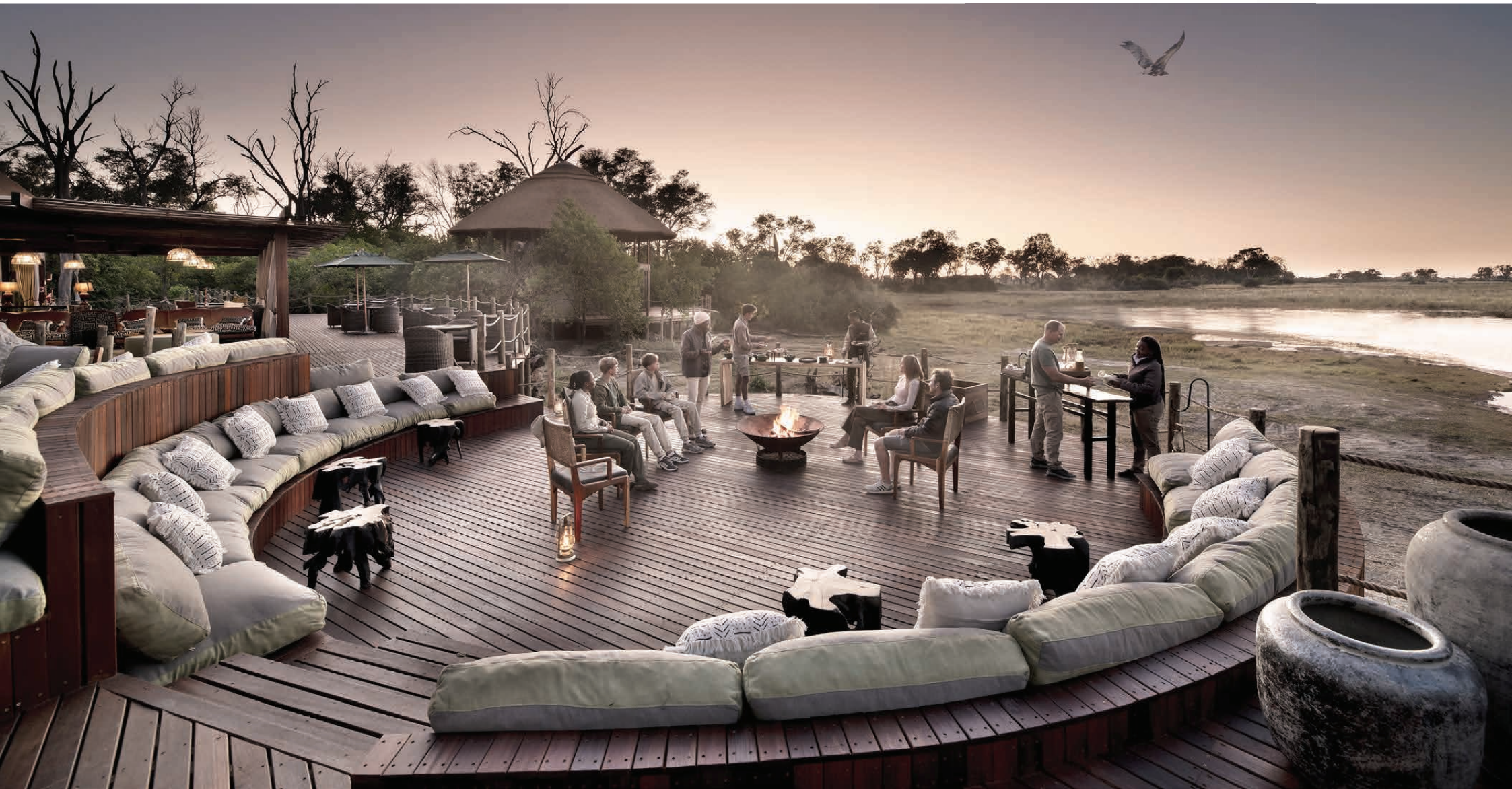
Sustainable luxury at the heart of the Okavango Delta, Botswana